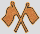
GCH48 COLOR GUARD