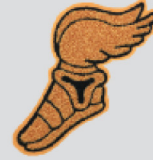
GCH29 TRACK FOOT