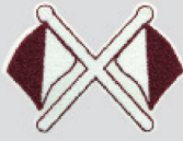
GCH49 COLOR GUARD