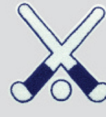
GCH18 FIELD HOCKEY