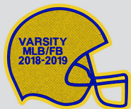
GCH10-H FOOTBALL HELMET