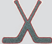
GCH21 HOCKEY GOALIE