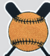
GCH5 SOFTBALL W/ BATS