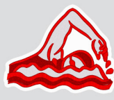
GCH44-F FEMALE SWIMMER