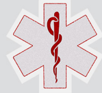
GCH92 STAR OF LIFE