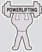
GCH82 WEIGHT LIFTING