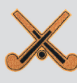
GCH17 FIELD HOCKEY