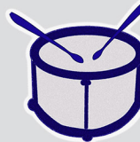
GCH90 SNARE DRUM