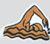
GCH44 MALE SWIMMER