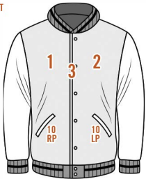
4 RIGHT SLEEVE